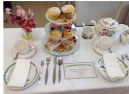
A mouth-watering selection of student's dishes!