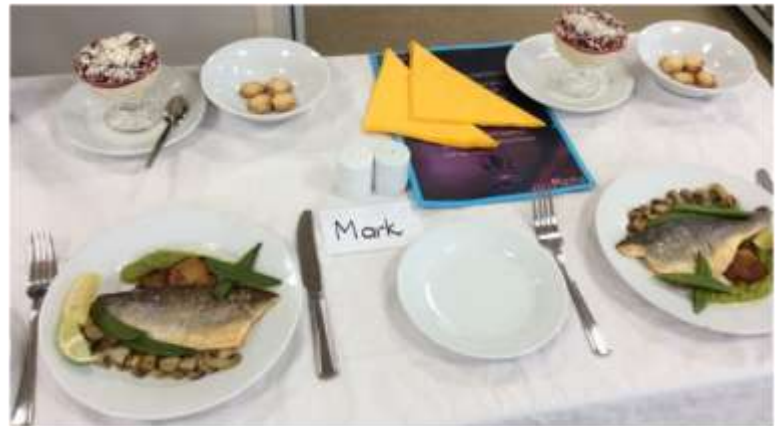
A selection of the wonderful meals!