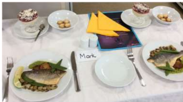
A selection of the wonderful meals!