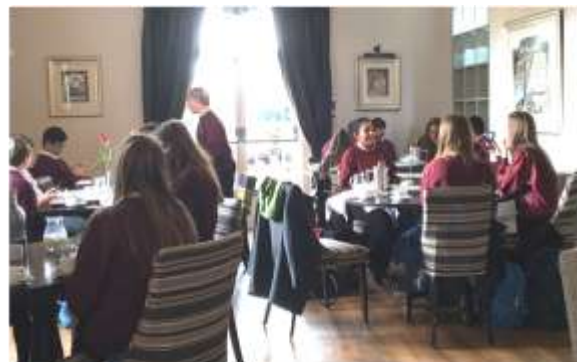
At Slepe Hall