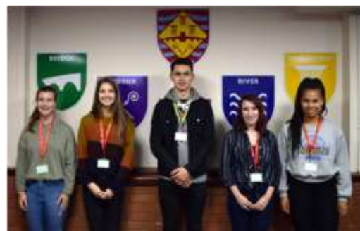
Congratulations to the House Captains!