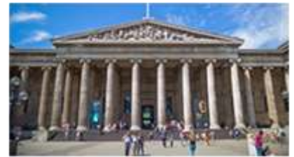
The British Museum

The newly formed Classics Department offers Classical Civilisation at both GCSE and A level and continues to offer Latin as an extra-curricular subject. We have recently collaborated with the Art Department with regards to a trip to Rome and Sorrento in the summer and we are very pleased with the popularity of this trip amongst our cohort. Looking forward to the year ahead, we are expecting a talk aimed at Year 9 from an Oxford Classicist, a trip to the British Museum and our first cohort of Year 13s sitting their A level exams. All very exciting!