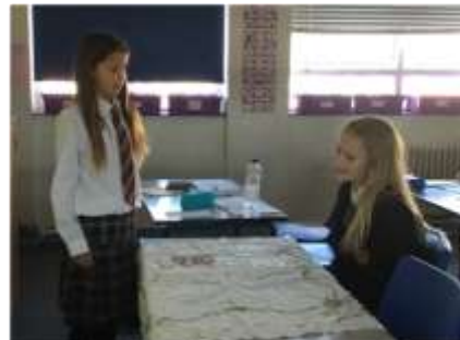
Maya is the waitress but what will Lana order?